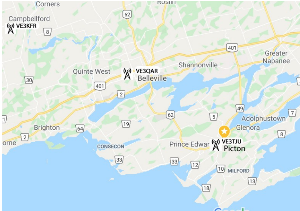
Figure 1 Quinte Region (Google Maps)

The southern part of central eastern Ontario from Brighton to Napanee up to Highway 7 is generally known as the Quinte region. It has a lot of real estate and relatively few amateurs. There are a number of vhf and uhf repeaters serving the area. A major one is VE3TJU, located on a former airbase high above Picton. This machine has a wide coverage throughout almost all the region. There are two clubs in the area - The Quinte amateur radio club (QARC) in Belleville and The Prince Edward County radio club (PERC). Many of the local amateurs belong to both and many club events, such as field day are done jointly. The region is shown in Figure 1